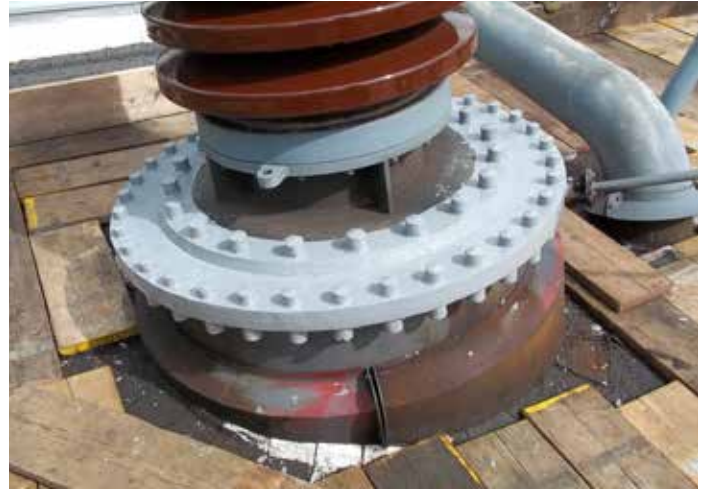
Belzona 5831 used for transformer oil leak sealing

Can be used as a complete repair solution in combination with Belzona 1161, a paste grade repair composite.